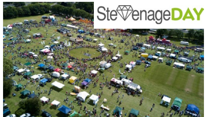
We celebrated Stevenage Day's 60th Anniversary

Volunteers from Glaxo helped the play team with a number of projects around the Pin Green Playcentre. These included turning a decked path into a gravel path fixed the treehouse, painted a mural in the under-fives area and generally helped to tidy up the grounds.